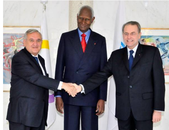
(l to r) Jean-Pierre Raffarin, Abdou Diouf and Jacques Rogge

On 22 January, IOC President Jacques Rogge welcomed United Nations Secretary General Ban Ki-moon to the IOC headquarters, where the two leaders agreed on an expanded framework of cooperation between the two organisations. President Rogge told Mr Ban of the IOC's commitment to using sport to further meet the goals of UN specialised agencies around the world. With 198 days to Beijing 2008, the meeting included a discussion on the positive effects the Olympic Games are hoped to have on China's social and economic development. The two leaders also discussed parallels between China and the benefits that the 1988 Olympic Games brought to Seoul's culture and economy. Read the two leaders' declarations at www.olympic.org (News section).