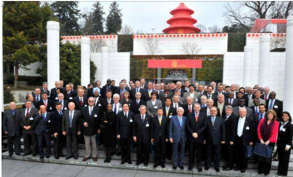
The participants of the 2 nd Seminar on the Autonomy of the Olympic and Sports Movement

On 11 and 12 February at The Olympic Museum in Lausanne, IOC President Jacques Rogge took part in the 2 nd Seminar on the Autonomy of the Olympic and Sports Movement, which brought together 170 representatives of the International Federations, National Olympic Committees and Continental Associations, as well as IOC members and senior staff. This 2 nd Seminar aimed to assess when and why the autonomy of sport had been threatened since the first Seminar in September 2006, and to agree on a set of principles and mechanisms to help the sports organisations deal with these issues. The participants discussed and supported a document entitled "Basic Universal Principles of Good Governance of the Olympic and Sports Movement", which will serve as a reference for all sports organisations. They also decided to create an Olympic and Sports Network to preserve the autonomy of sport, facilitate the exchange of information and react quickly to imminent threats. Finally, a seven-point resolution and a plan of action were adopted. You can read the press release and download the documents at www.olympic.org .